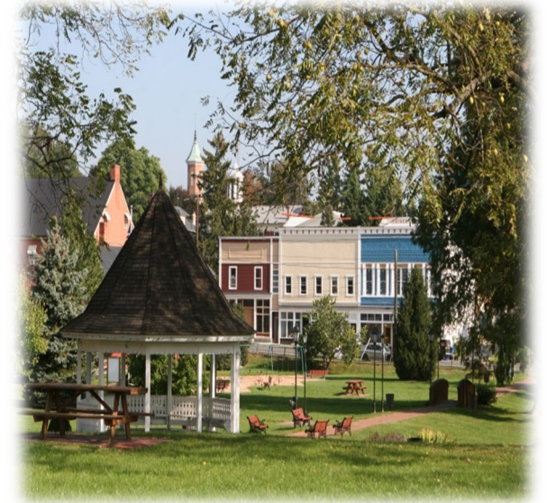
Rose Hill Park

We hope this guide will be of help to you as you settle into your new home and community. Please do not hesitate to call or stop by the Town Office if you have any questions or need additional information, local street maps, or any other assistance we may be able to provide, or just to exchange a friendly "hello."