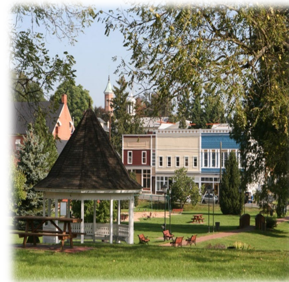
Rose Hill Park

We hope this guide will be of help to you as you settle into your new home and community. Please do not hesitate to call or stop by the Town Office if you have any questions or need additional information, local street maps, or any other assistance we may be able to provide, or just to exchange a friendly "hello".