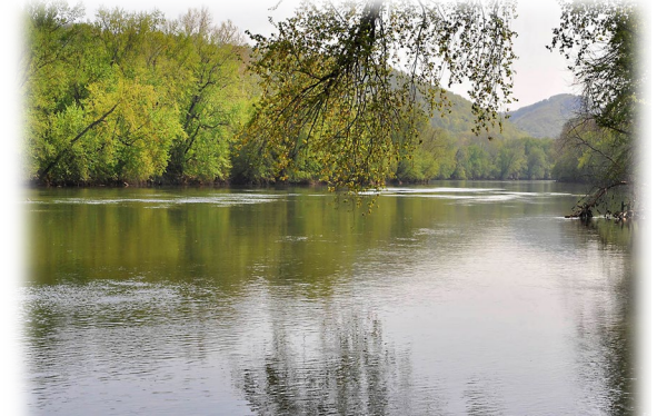
Shenandoah River, Clarke County

The Town of Berryville is committed to providing its customers with a safe and dependable supply of drinking water and being a good steward of the Shenandoah River and the Chesapeake Bay when treating wastewater. This brochure provides our customers with information regarding water and sewer utilities and billing.